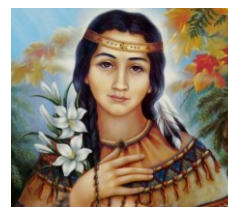
St. Kateri Tekakwitha (1656 -1680)