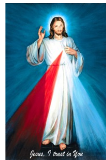
The Divine Mercy Devotion. Saint Maria Faustina

"Eternal Father, I offer you the Body and Blood, Soul and Divinity of your dearly beloved Son, our Lord Jesus Christ in atonement for our sins and those of the whole world." "For the sake of his sorrowful Passion, have mercy on us and the whole world."