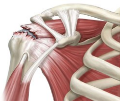
Torn Rotator Cuff

The time to retire from active duties as a priest has arrived. At the end of November, I will lay down all that was familiar and move to a small house in Sweet Bay, Bonavista Bay. It is time now to pass the torch, and hopefully, give this spiritual work over to a fresher face, with new thoughts and more energy. For over fifty five years I have been a priest in the Diocese of Grand Falls and I thank God constantly for this wonderful life. But the time has come, and hopefully, there will be time to rest about in my slippers. Amen.